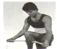
Good on Calves

The Acu-Masseur also massages and penetrates deeply into the occipitals. It can also perform wonders by massaging the calves, hamstrings, arms, quads, obliques, or down the hips & legs.