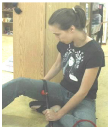
Great on Quads (or hamstrings)

One of the speakers at a recent Regional Massage Therapy Show spoke at great length on the value of massaging the trapezius muscles. However, to do these points on yourself (in a stress-free way), it is next to impossible. But now you can! (with the Acu-Masseur). There is nothing that can help release the pressure points on the neck & shoulders like the Acu-Masseur. By holding the “golf-like” balls in place, grabbing the trapezius muscles (or the rhomboids), using the string , and then slowly moving the neck in the other direction, and by lifting the chin up and down in that same direction, one can experience minor miracles in stretching. One can also wiggle the front acu-masseur handle across the chest, back and forth (not up & down) to experience other minor miracles in releasing muscle tension.