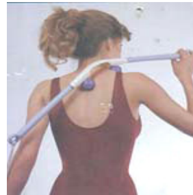
Acu-Masseur using string on Shoulder