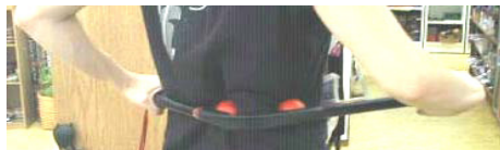
Wonderful on Obliques

This is The Original Acu-Masseur - It does NOT collapse as you squeeze the traps. Imported since 1982 - Quality workmanship.