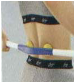
Acu-Masseur on Back