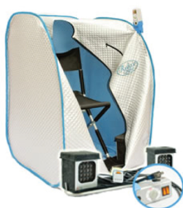
Sit Up Sauna

Try the Relax Sauna for 5 minutes, and experience Wonderfulness, Gratefulness & Relief from All sorts and kinds of aches & Pain. In only 5-10 minutes we have seen over 5000 Minor or Major Miracles. ---- People reporting relief of Fibromyalgia, migraines, asthma, headaches, digestion difficulties, sinus draining, and much more. We have reports of the Relax Sauna helping with Lyme Disease, Oxygen Deprivation, Diabetes, and Meditating, heart problems, cancer and much more. Ask for our research papers.