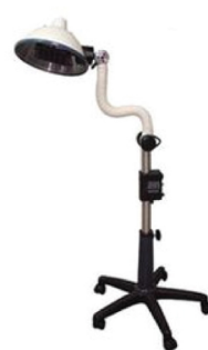
Sky Eye Medical Device

Remarkably fast at getting rid of inflammation and PAIN!