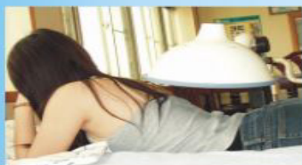
Horizontal application for lower back injury